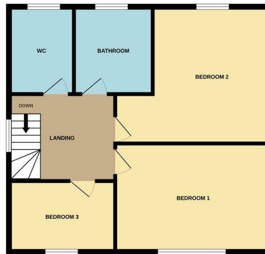
1ST FLOOR 659 sq.ft. (61.2 sq.m.) approx.